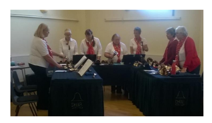
Dean Handbell Ringers