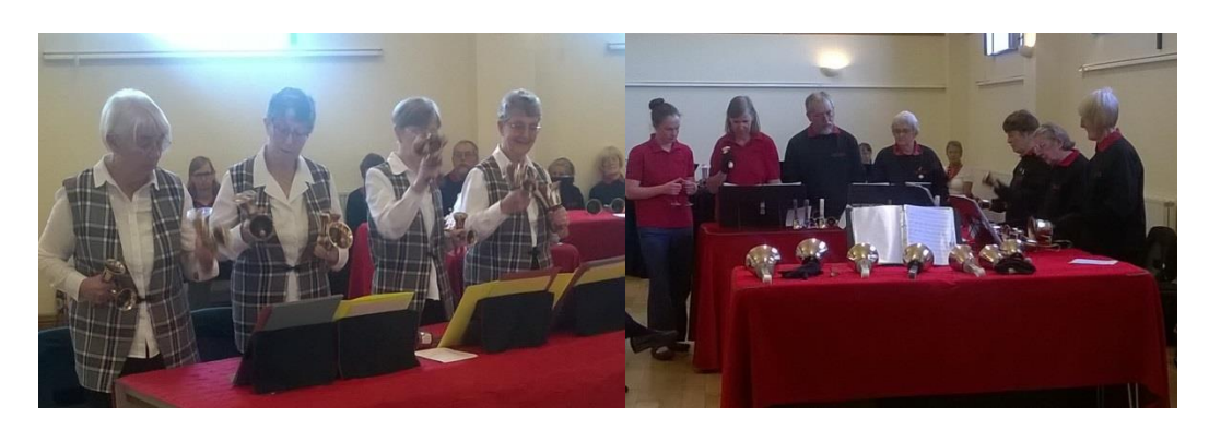
Kinder Quartet and Kirkby Lonsdale teams